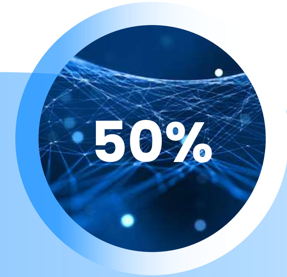
increase in process transparency