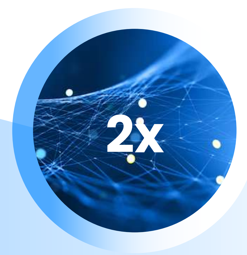
faster issue resolution