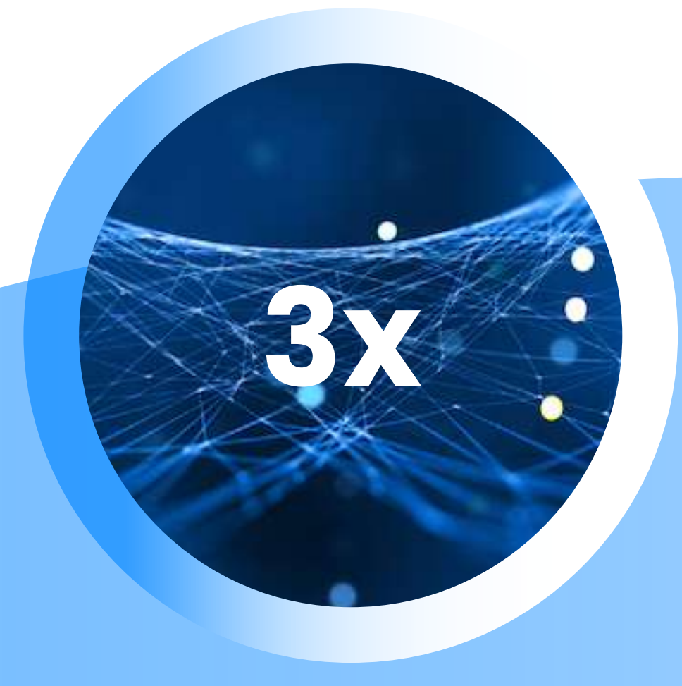
improvement in HR efficiency